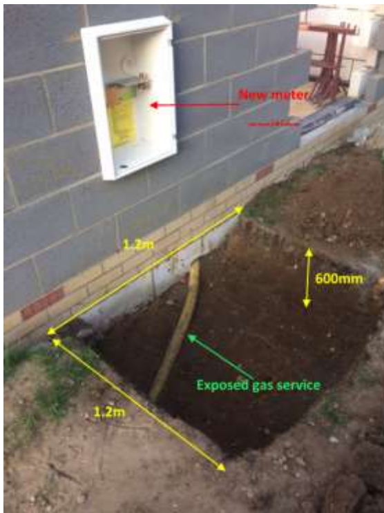
Excavation at service pipe