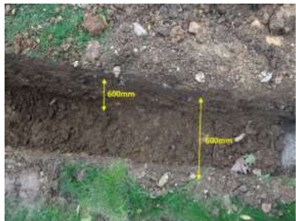
Trench for new service